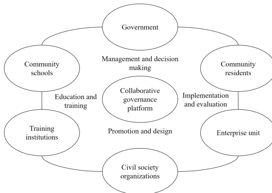
Figure 1 "Six dimensional" integrated collaborative governance model

The mechanism of integrating community education into community governance is a multi-dimensional collaborative process aimed at promoting the comprehensive development of the community and the improvement of resident literacy through cooperation from multiple aspects [9]. In response to the current problems of integrating community education into community governance in China, such as lack of subject, ability, content, and concept, this article constructs a "six dimensional" integrated collaborative governance model (as shown in Figure 1). In this model, the role and interaction of each dimension are crucial. As the leader of community governance, government departments are responsible for comprehensive planning and policy guidance. The government lays a solid foundation for the integration of community education and community governance by formulating relevant policies, providing funding and resource support [10].